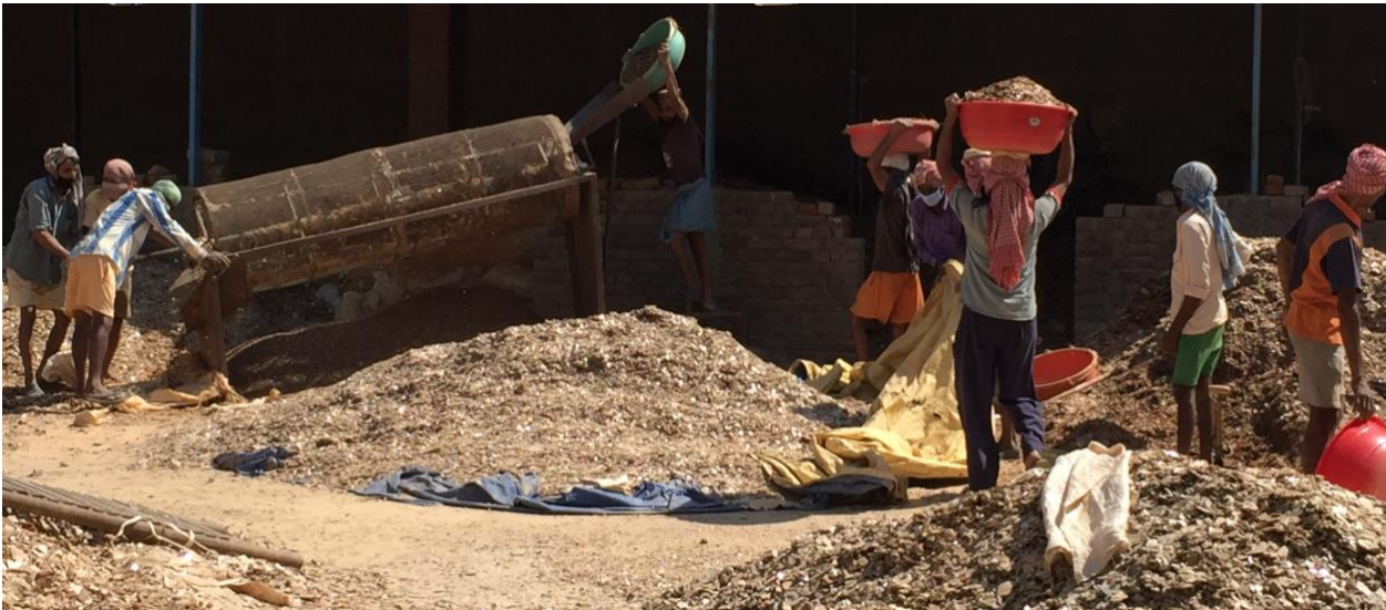
Mica processing, India

RMI and its members are confident that pursuit of these six broad initiatives, implemented within RMI’s program pillars, will enable workers in the mica sector to receive living incomes and wages by 2030. While working on these pillars, RMI has embraced the UN Guiding Principles on Business and Human Rights (UNGPs) and incorporated its due diligence processes, offering to RMI members a concrete answer to existing and upcoming Human Rights & Due Diligence regulations, on the specific mica case.